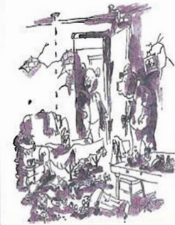
"No - no - no"

(3) Natural biases and limitations of upbringing or indoctrination may inevitably lead us to hang on to preferred beliefs ( to simply do things right ) and ignore or resist doing the right thing .