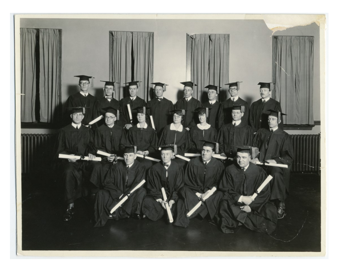
Graduation Group Photograph, 1924 https://fuse.franklin.edu/commencement/1/