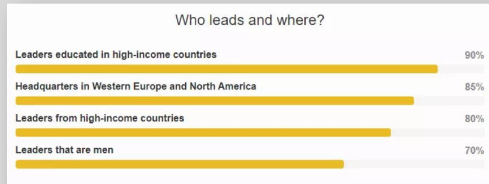
Figure 3. Who leads and where. Adapted from “7 to 10 global health leaders are men”, by E.Charlton,2020,April,16,World Economic Forum. Copyright 2021by World Economic Forum.