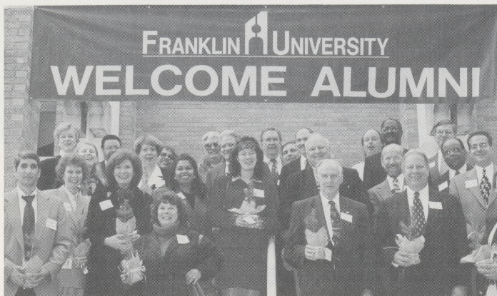
Alumni gather on the steps of Alumni Hall for the Wall Unveiling.