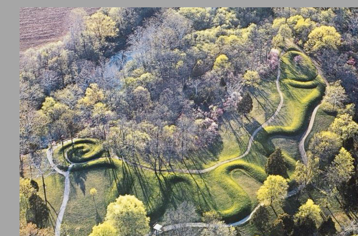
Native American Heritage Speaker Event