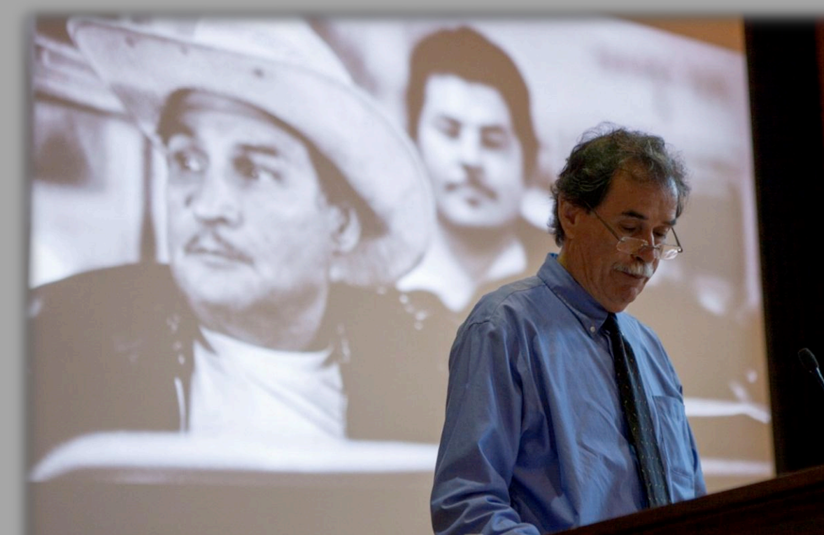
Hispanic Heritage Month