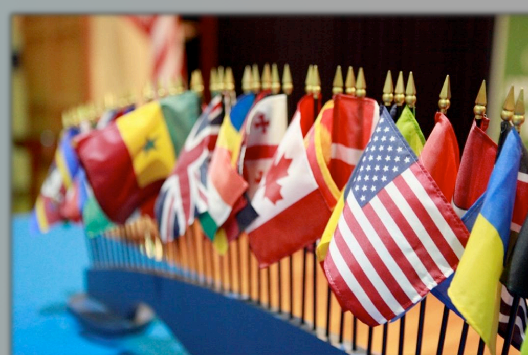
Politics on a Global Scale