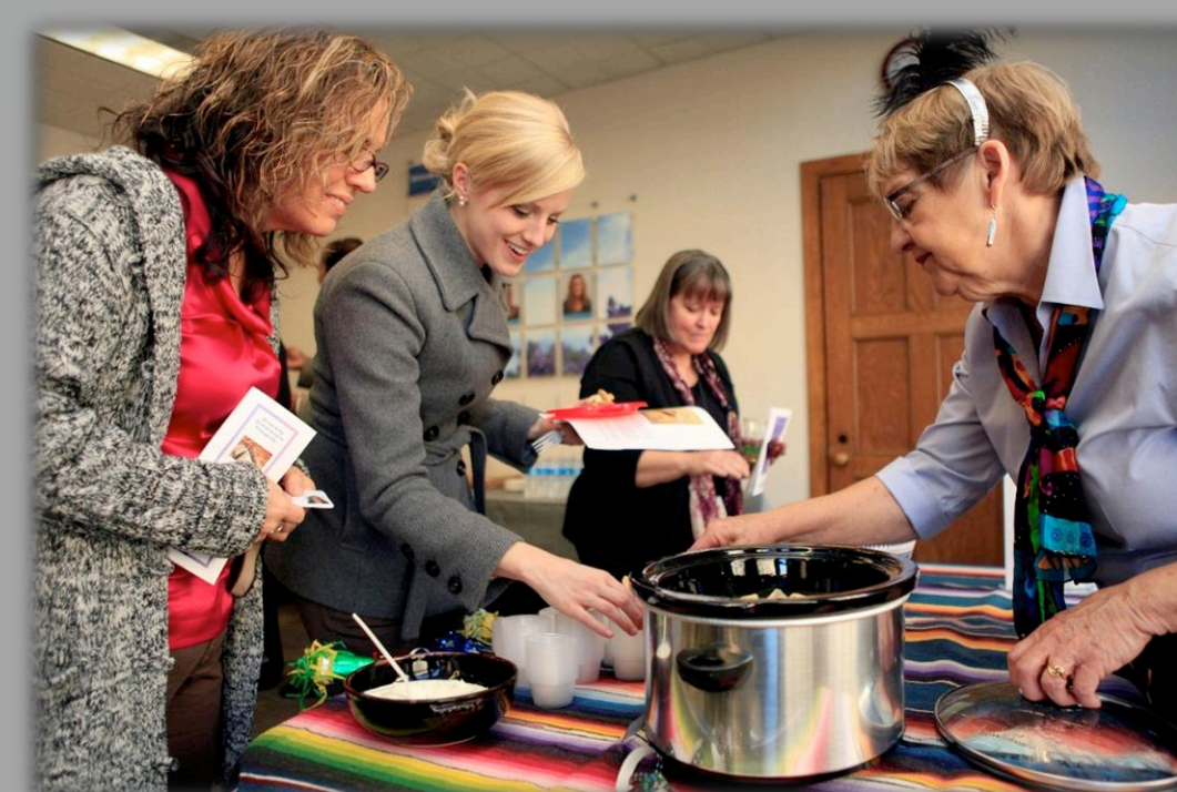
New Year's Around the World