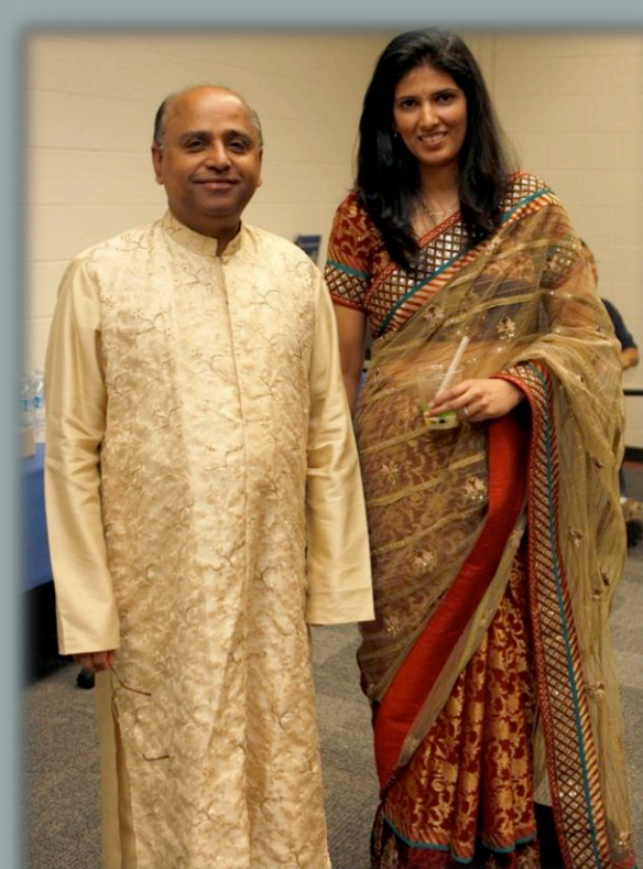
Spotlight on Asia